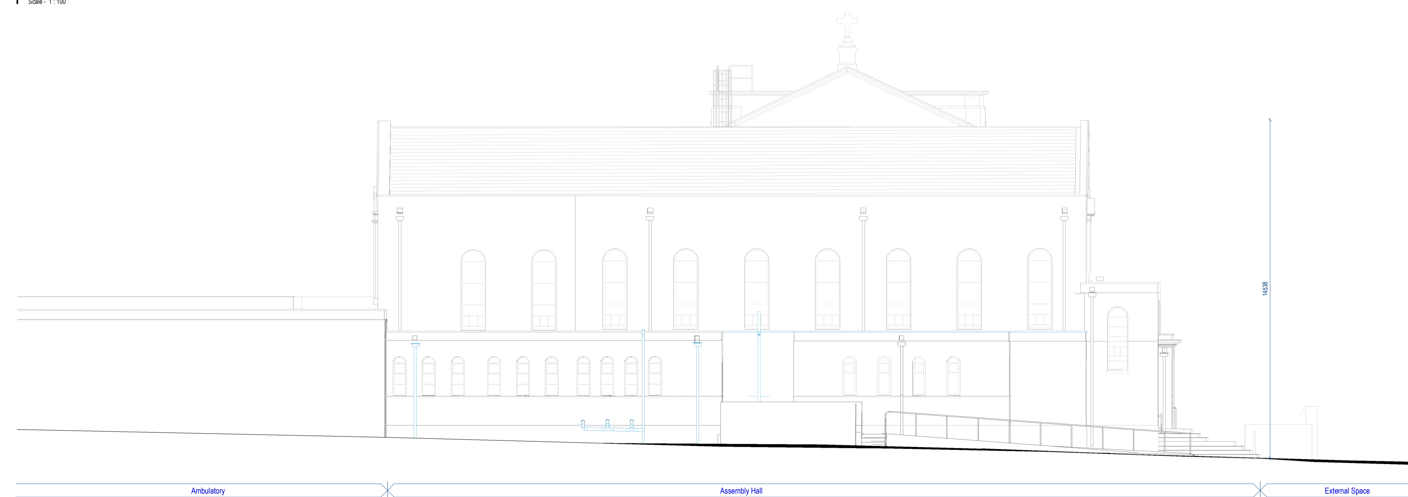
1 South Elevation-Demolition Scale - 1:100